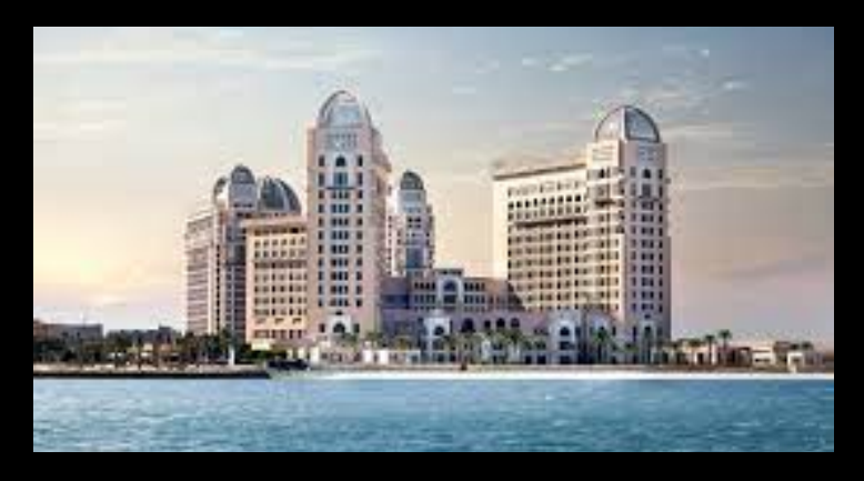
The St. Regis Doha is located on the West Bay, near the Diplomatic District in Qatar's sophisticated capital city.

The advantages of the FIFA World Cup being held in Qatar mean so many great hotels are available to experience. Let's begin by the St. Regis Doha.