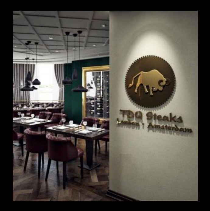
"Our goal was to spread the message that TDQ is the new family friendly venue to be in with high quality meals and a luxurious design"

dinners great service and good atmosphere. Located in Embankment, offering prime cuts of beef from five different continents, that have exclusively imported this restaurant is built from true culinary passion that is dedicated to serving only the finest, most exclusive visitors ingredients. For who prefer something different then TDQ offers a diverse range of fresh seafood options burgers, pastas and meat dishes. Ranging from Maori Lake rack of lamb to Akami Bluefin from Japan, wild salmon from Alaska and lobster tail from the Caribbean.